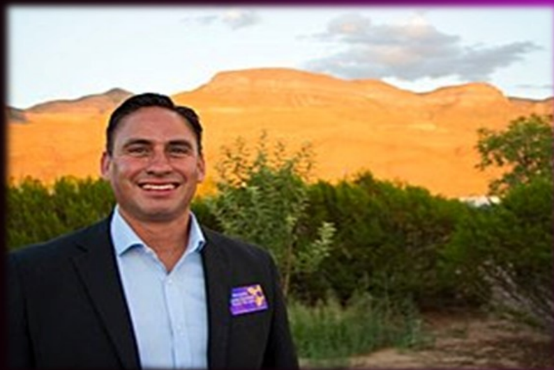
Lieutenant Governor Howie Morales